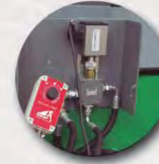
REGULADOR ELÉCTRICO ELECTRICAL REGULATOR