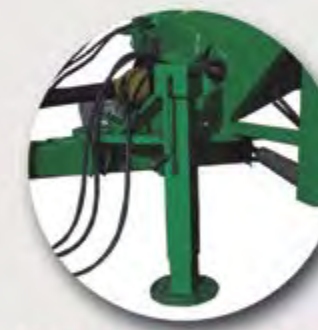
LANZA GIRATORIA HIDRÁULICA REVOLVING HYDRAULIC DRAWBAR