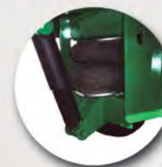
AMORTIGUACIÓN LANZA NEUMÁTICA SPRUNG PNEUMATIC DRAWBAR