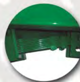
AMORTIGUACIÓN LANZA BALLESTA SPRUNG DRAWBAR