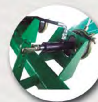
FRENO MIXTO MIXED BRAKE