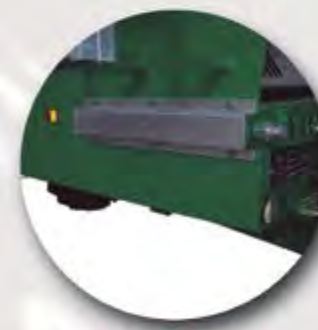
TENSOR DE CADENAS TENSIONER FOR CHAINS