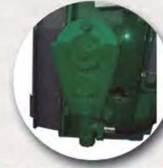
REDUCTOR Y MOTOR HIDRÁULICO REDUCER AND HYDRAULIC MOTOR