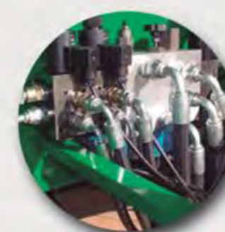
ENCHUFES ELÉCTRICOS SOCKETS