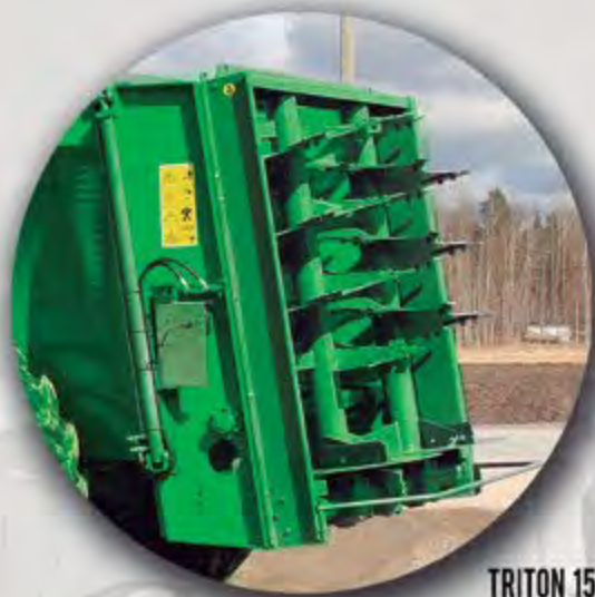
TRITON 150 Y 120

GRUPO DE 2 RULOS GROUP OF 2 AUGER BEATERS