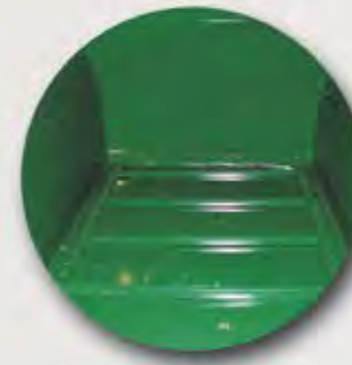
TAPIZ DE 2 CADENAS 2 CHAINS