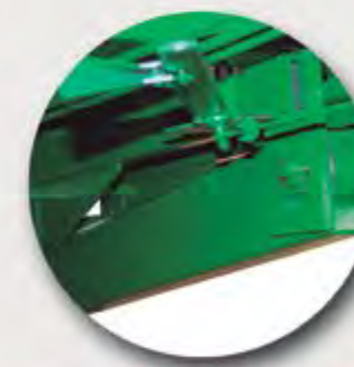
AMORTIGUACIÓN LANZA SILENTBLOCK SPRUNG DRAWBAR - TYPE SILENTBLOCK