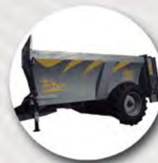
CAJA GALVANIZADA GALVANIZED BOX