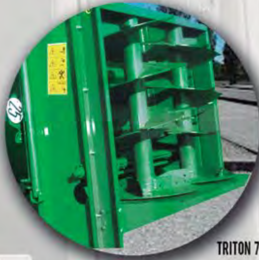
TRITON 75L Y 55

LIMITADOR LATERAL DE ESPARCIDO LATERAL LIMITER OF SPREADING