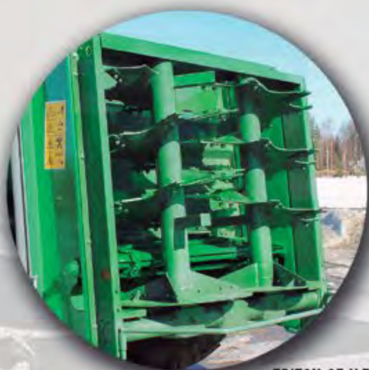
TRITON 95 Y 75

GRUPO DE 2 RULOS GROUP OF 2 AUGER BEATERS