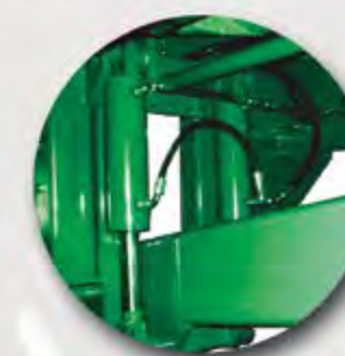
AMORTIGUACIÓN LANZA HIDRÁULICA DRAWBAR WITH HYDRAULIC SUSPENSION